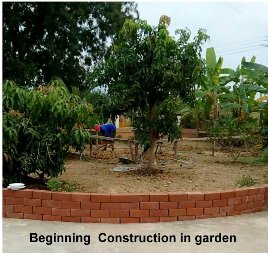
Beginning Construction in garden