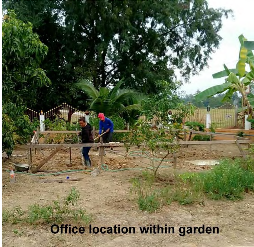
Office location within garden